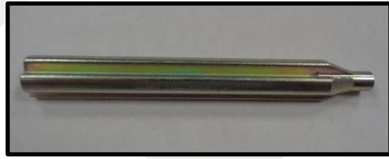
15 – Scoring wheel 80 Ø 10 aligner